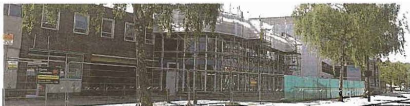
■ The former Riley's building which is being demolished to make way for Birketts