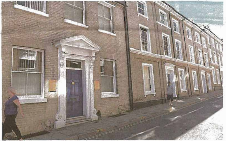
■ Birketts' offices in Museum Street are expected to be converted to homes

“The buildings are all listed, in many cases inside as well as out, so there are limits on what could be done with them but I